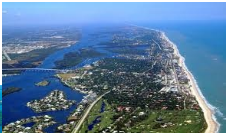
Vero Beach, Florida